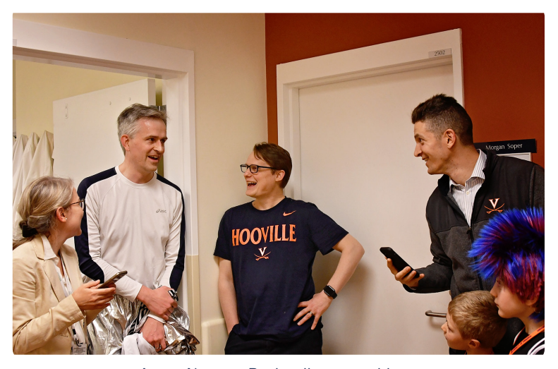
A very Norman Rockwell-esque tableau