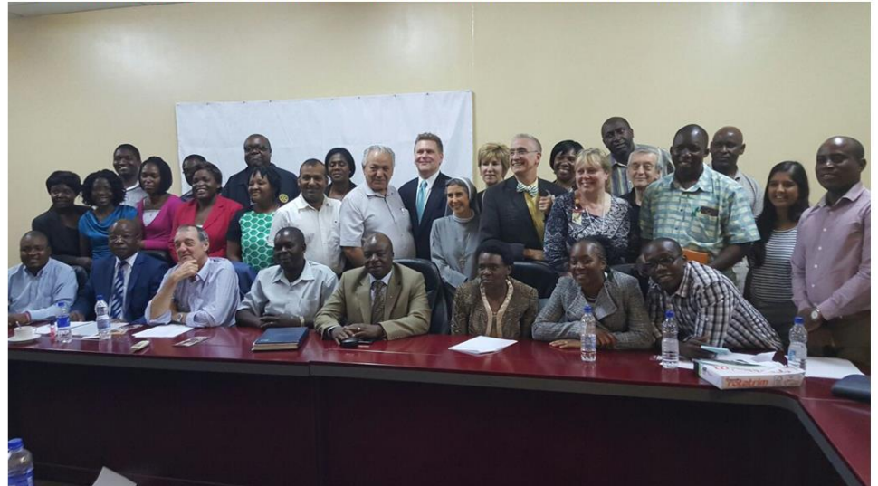
STAKE HOLDERS MEETING ON THE ROADMAP FOR DEVELOPMENT OF SUSTAINABLE CARDIAC SERVICES IN ZAMBIA